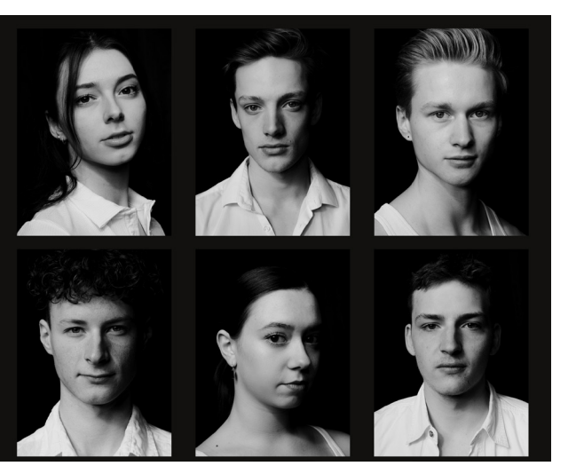
We wish our Bachelor and Master graduates all the best and successful careers.

class 1) and who have now successfully completed their 9-year dance education: